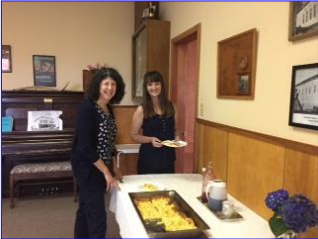
University of Oregon students enjoying pannukakku